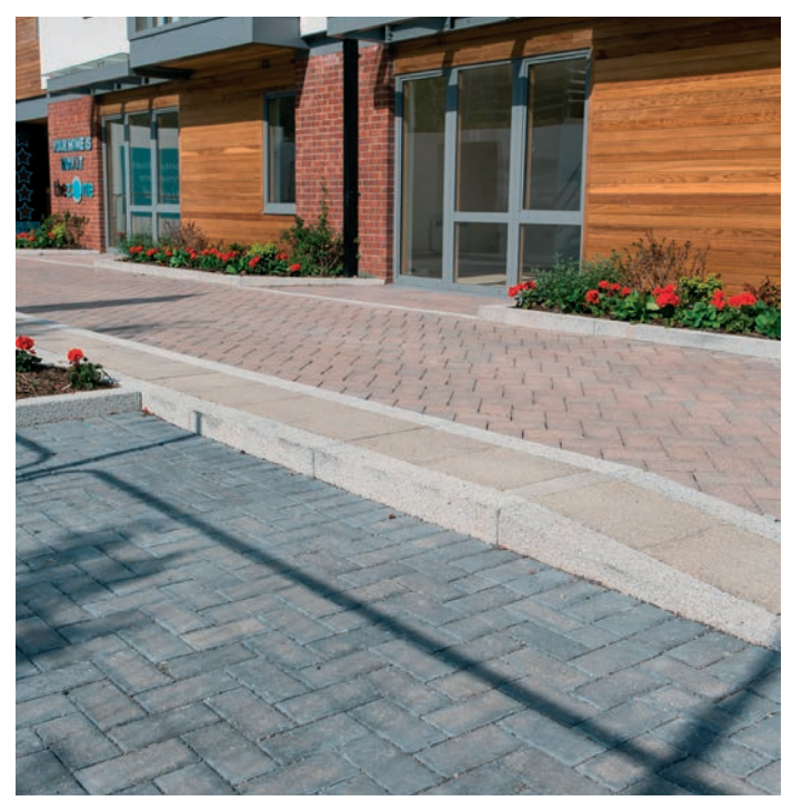
Formpave – innovators in permeable paving for over 20 years

"Our designers have specified the company's paving and SUDS in many of our developments because they offer a complete service and can design a bespoke system to make sure we meet planning conditions and specifications."