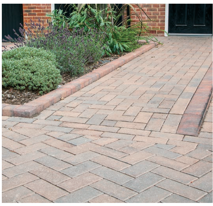
Formpave – innovators in permeable paving for over 20 years

Formpave has provided paving solutions to David Wilson Homes on a range of developments, using its design service to offer a bespoke solution that suits each project's criteria.