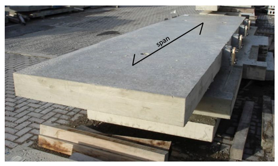
Figure 1 - RC landing slab with 4No. cast in thermal breaks.

Should cast in inserts be required these are bolted to the formwork and cast in the factory. As the slab is cast with top and bottom steel there is usually no requirement to add additional steel reinforcement.