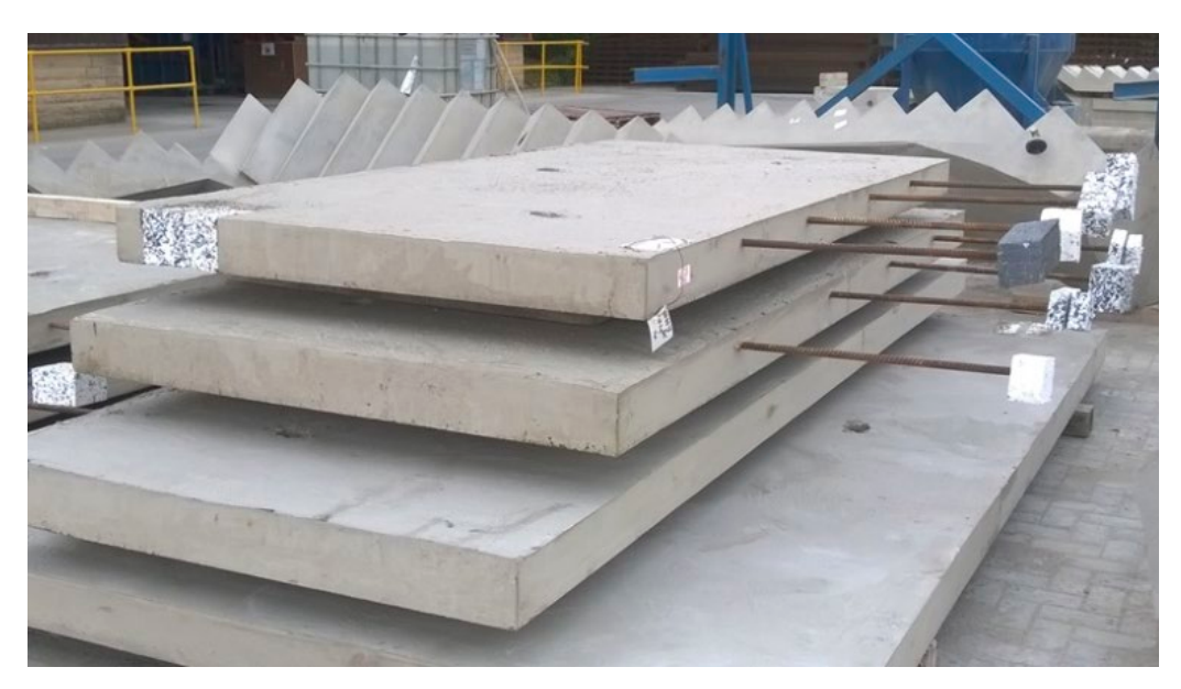
Figure 4 - Simple RC slab with cast in bars for tying back to the main floor slab.

Simple balcony slabs can be cast that are supported independently of the main floor slab and can be provided with cast in bars to tie the slab back to the main floor if required.