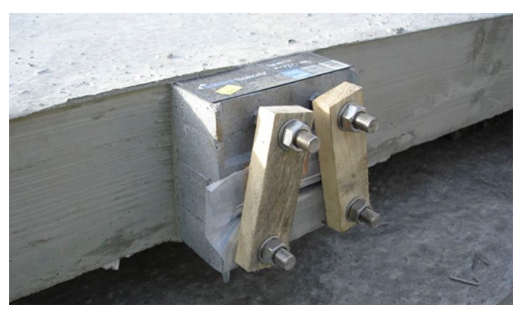
Figure 2 – Close up of cast in thermal breaks.