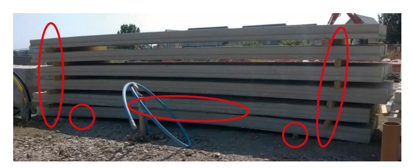
Figure 3 – Poorly stacked beams resulting in severe camber on bottom of stack