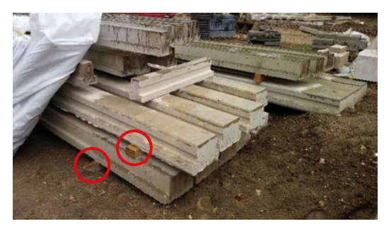
Figure 2 – Poorly stacked beams