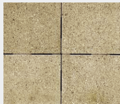
Tintagel * †