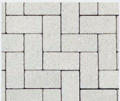
Cornish Silver Grey