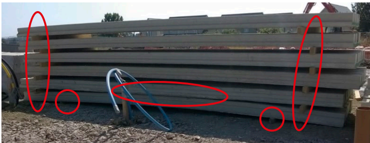
Figure 3 – Poorly stacked beams resulting in severe camber on bottom of stack