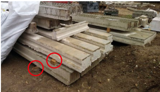
Figure 2 – Poorly stacked beams